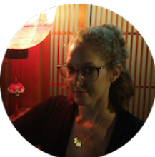
Face not clearly shown