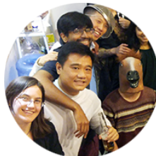
Showing other people